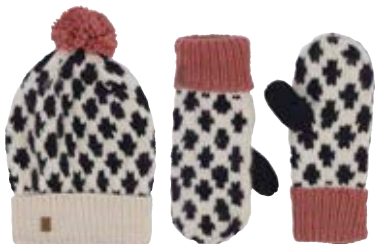
• Diamond Navy Blue •