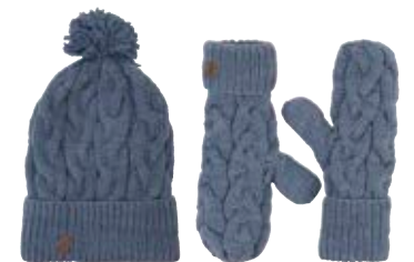
• Light Blue •