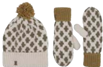
• Diamond Dusty Green •