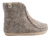
• Natural Grey •