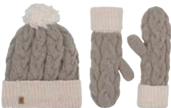
• White/Light Grey •