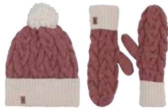
• White/Dusty Rose •