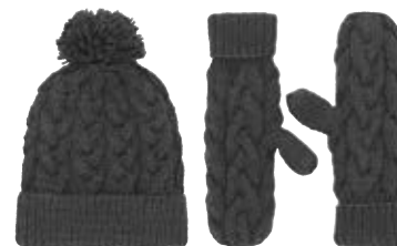
• Dark Grey •