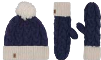
• White/Blue •