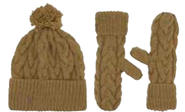
• Gold Brown •