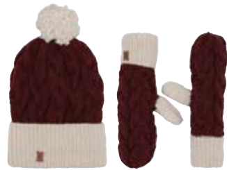
• White/Bordeaux •