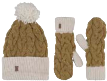
• White/Gold Brown •