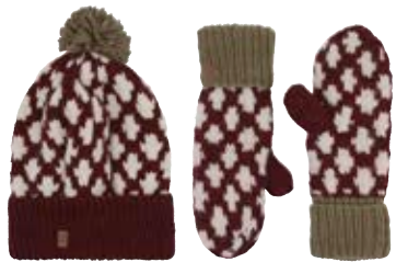
• Diamond Bordeaux •