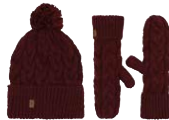
• Bordeaux •