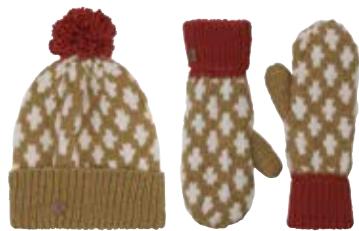
• Diamond Gold Brown •