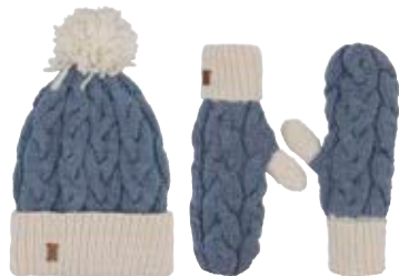
• White/Light Blue •