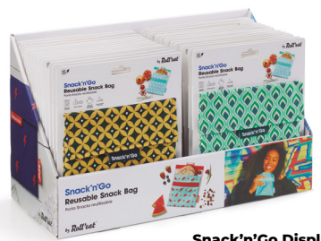
Snack'n'Go Display 30 units